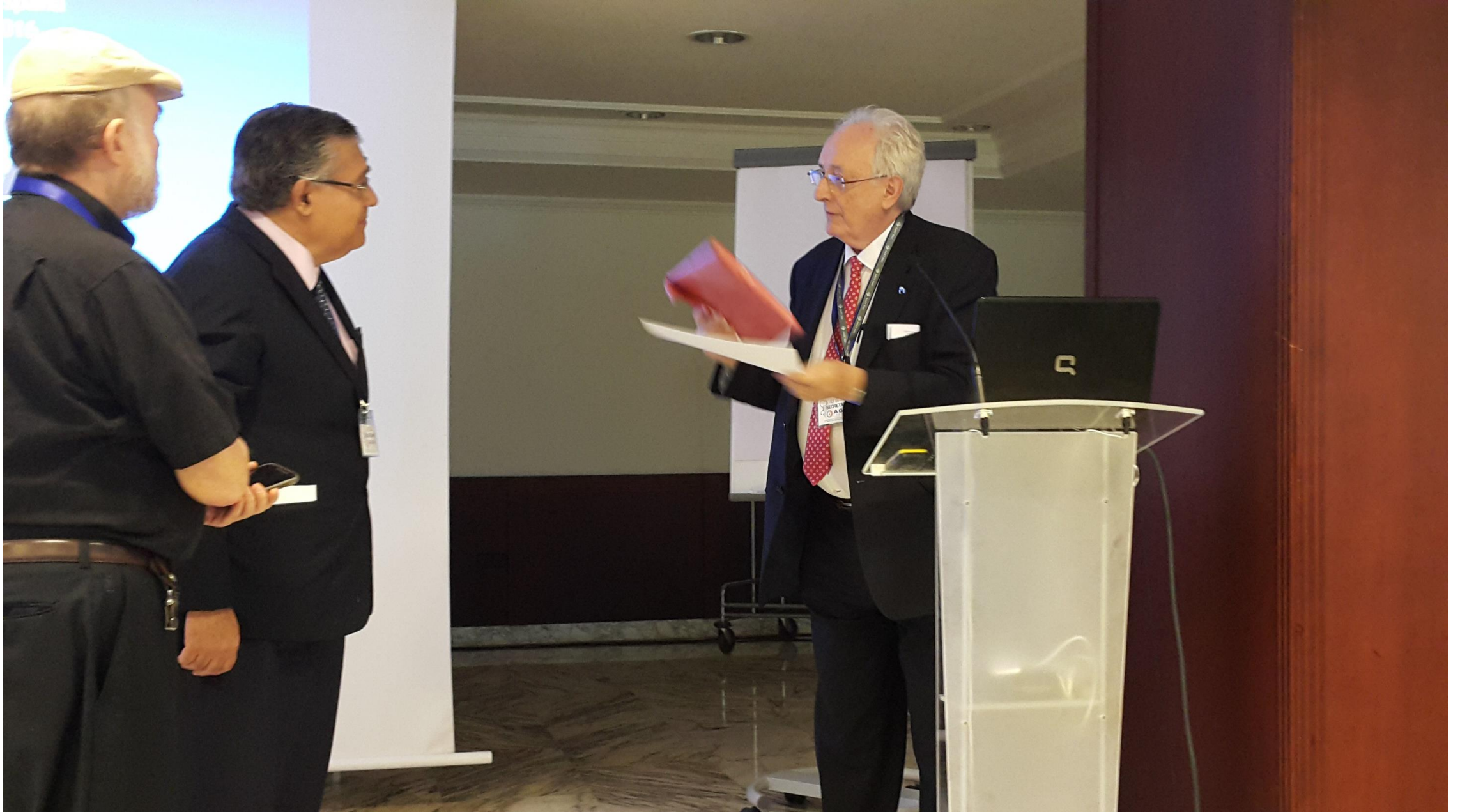
Awards'ceremony of Master of FIAI