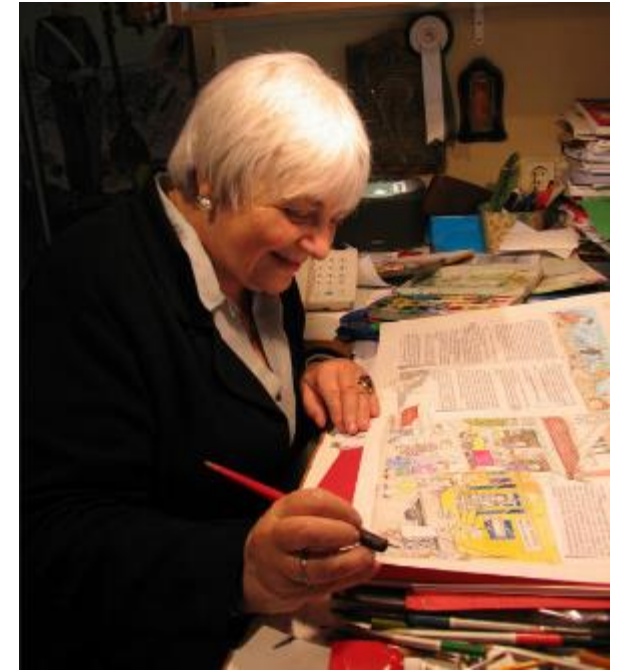
Pilarin Bayes de Luna, artist