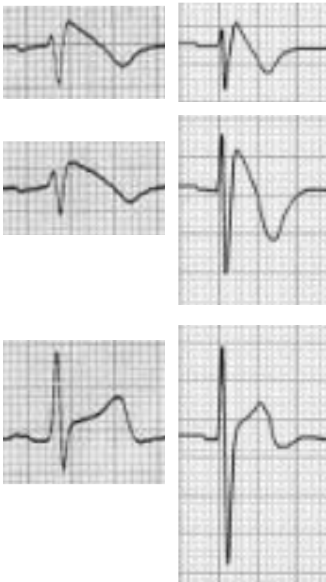
Type 1 Brugada pattern