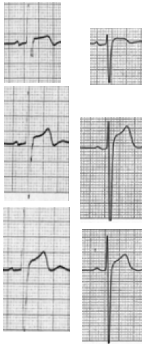
STSE \geq 0.2 mV non type 1 and non type 2 BrP