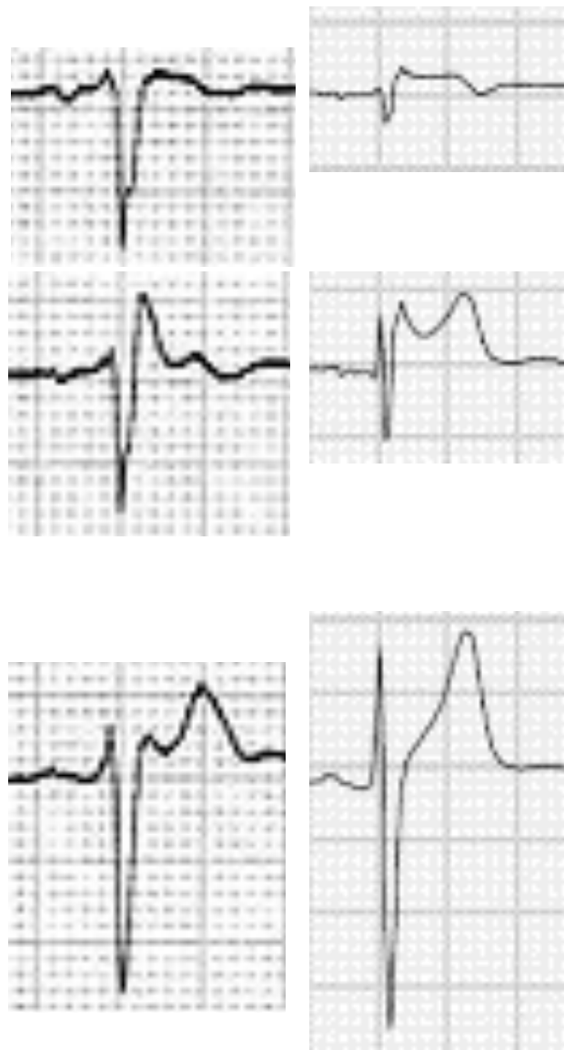
Type 2 Brugada pattern